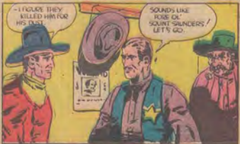
HWY TOM RIDES AWAY A FIDDLE ADDIARS